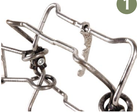
«BODY GRIPPER» MAGNUM